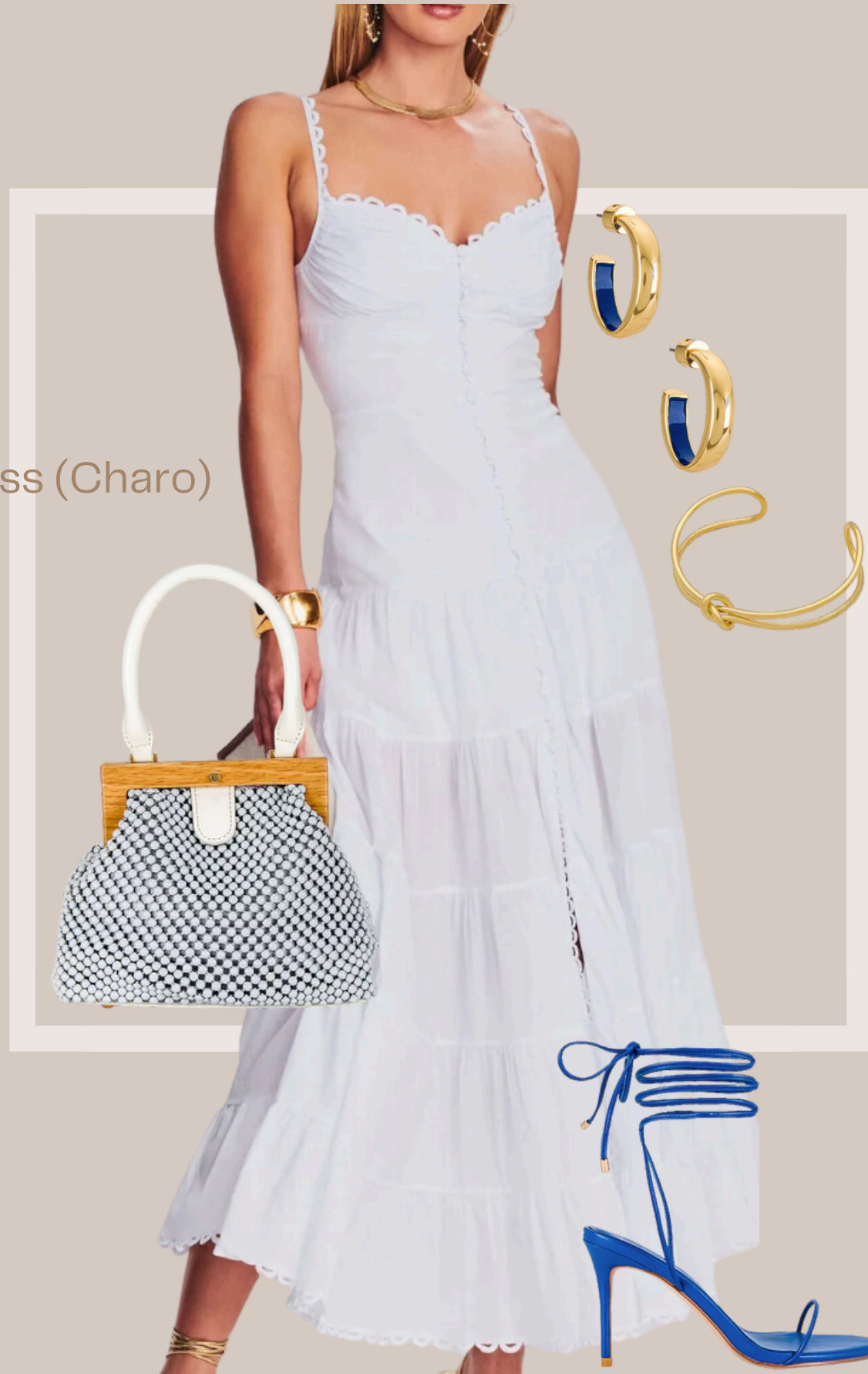
Malia Dress (Charo)