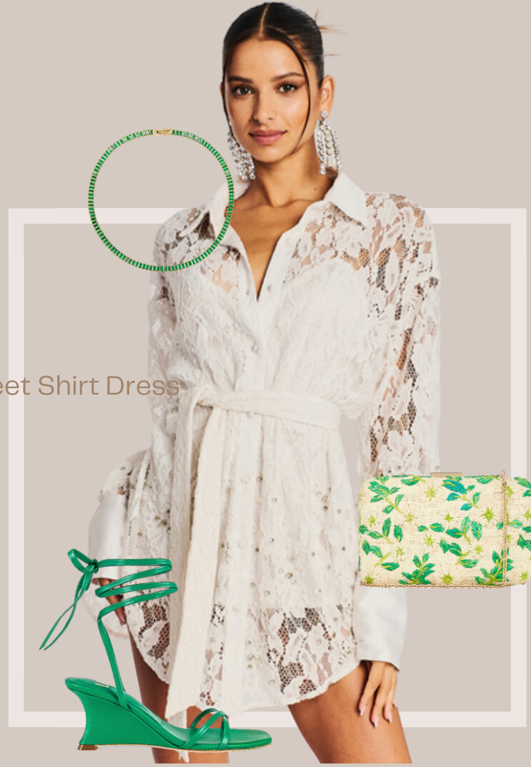
Reet Shirt Dress